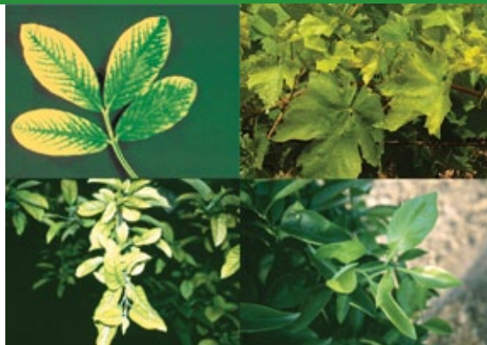
Typical symptoms of iron deficiency